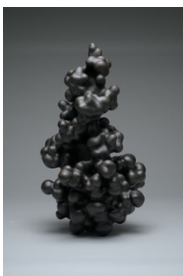
Multiplication 2022.2 / Lacquer, cloth, coating powder / h63×w35×d35cm / 2022