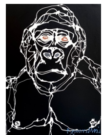
Gorilla/ Masking medium and acrylic on canvas / h72.7×w53×d3cm / 2022