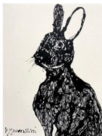
Rabbit/ Enamel, Japanese paper on panel / h53×w41×d3cm / 2023