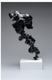
Rhythmic movement 2021.2 / Lacquer, cloth, coating powder / h67×w35×d25cm / 2021